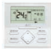
Wired Remote for Group Controller (Optional)